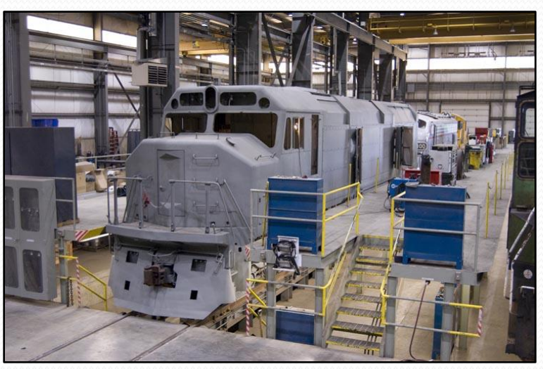
Poly-Chemcure PC-2.8 @ 2 mils DFT can be recoated in 60 minutes at 90°F and 105 minutes at 75°F. PC-2.8 is sandable in 4 hours at 90°F and 5 hours at 75°F.