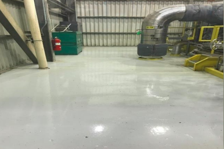
PC-1850 100% Solids Epoxy used in a turbine room.